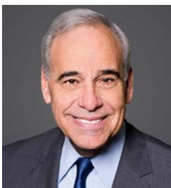
Hon. Charles A. Gonzalez Ogletree Deakins San Antonio (210) 277-3606 Charles.gonzalez@ogletree.com